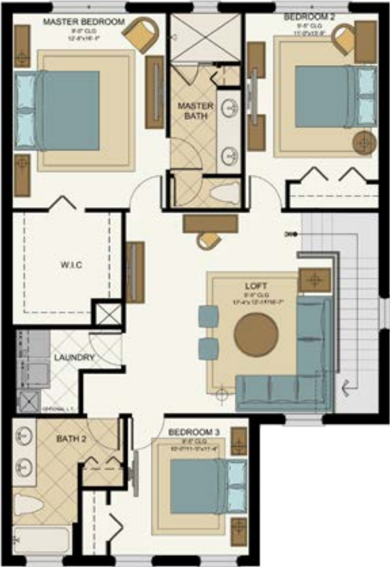
2ND FLOOR PLAN • LOFT OPTION