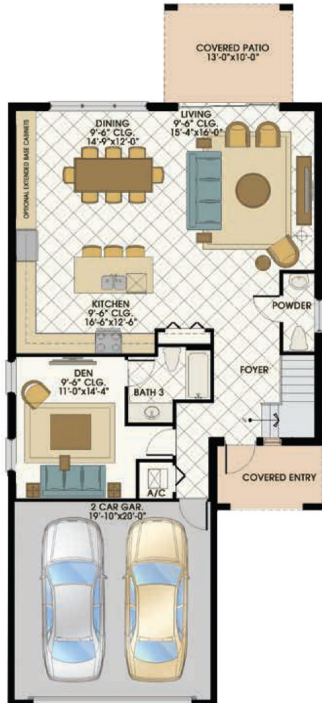
1ST FLOOR PLAN • DEN OPTION